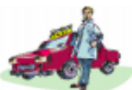
T _____ d _____